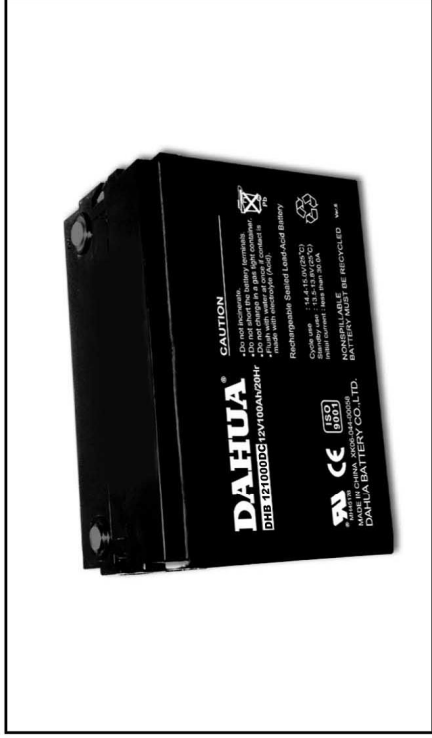
Dimensions 尺寸 (mm)